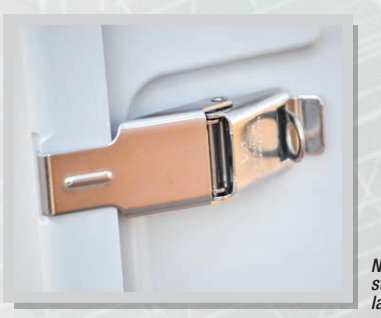
Non-penetrating stainless steel latches