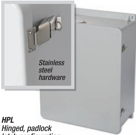
HPL Hinged, padlock latch configuration