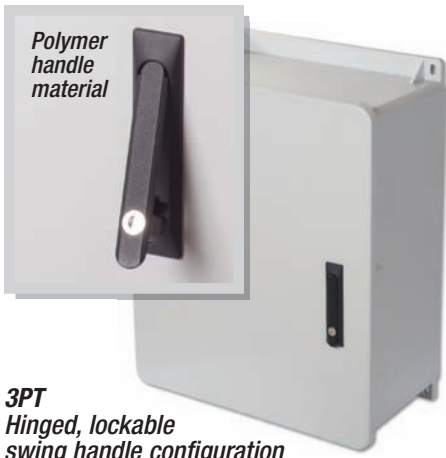
3PT Hinged, lockable swing handle configuration